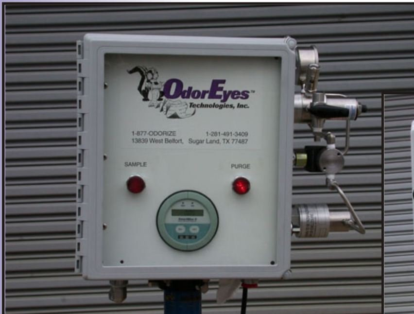
Fixed OdorEyes Monitor System

During each sample sequence, gas flows through the sensor chamber for four minutes at 0.5 liters per minute. The mercaptan measurement is an average concentration compiled during this sampling cycle. The latest reading is indicated by a four-digit display in pounds of mercaptan per million standard cubic feet of gas. It is also transmitted as a linear 4-20 mA DC signal with span of 0.0 to 2.0 lbs/MMscf. Programmable alarm signals and a communications link using RS-485 and MODBUS protocol are also provided. With periodic calibration using a known gas, accuracy is \pm 3\% of full scale.